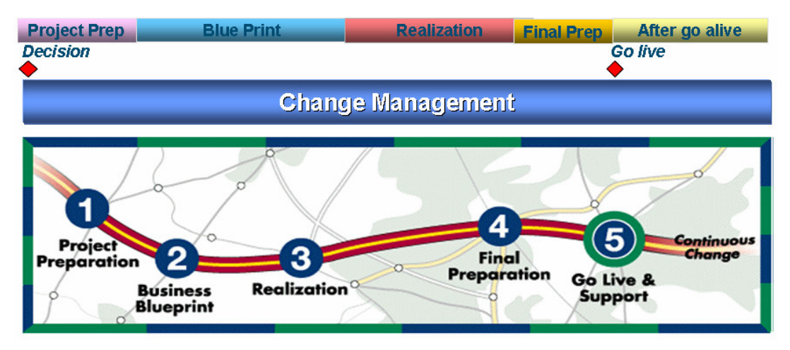
Figure 3: SAP implementation process

In addition to the 17 blueprint teams, three integration teams, one for each of the three modules, were formed to handle vertical integration. An overall integration team was assigned the task of overall integration. Finally six horizontal teams were formed to handle issues of change management, quality assurance, interfaces, development, infrastructures and information security. Overall 27 teams were set up to develop blueprint documents. A top management steering committee supervised the whole effort and provided strategic directions and tactical priorities. Change management was identified as an ongoing activity throughout the life of the project and, in that context; several activities were performed including a mapping of CEAO chains from the work of the blueprint teams. Change Management activities were lead by the Human Resources Vice President in parallel to the SAP implementation (see Figure 3).